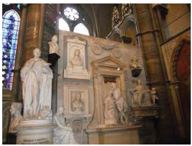
Poets' Corner is the name traditionally given to a section of the South Transept of Westminster Abbey because of the high number of poets, playwrights, and writers buried and commemorated there. The first poet to be interred in Poets' Corner was Geoffrey Chaucer in 1556. Over the centuries, a tradition has grown up of interring or memorialising people there in recognition of their contribution to British culture.