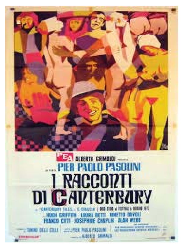
The Canterbury Tales (Italian: I racconti di Canterbury) is a 1972 Italian film directed by Pier Paolo Pasolini and based on the medieval narrative poem The Canterbury Tales by Geoffrey Chaucer. It is the second film in Pasolini's "Trilogy of Life", the others being The Decameron and Arabian Nights. It won the Golden Bear at the 22nd Berlin International Film Festival. The adaptation covers eight of the 24 tales and contains abundant nudity, sex and slapstick humour. Many of these scenes are present or at least alluded to in the original as well, but some are Pasolini's own additions.