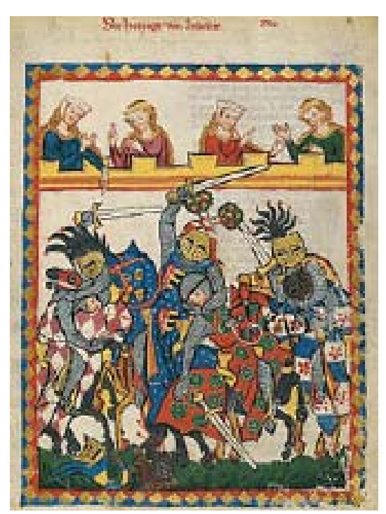
A tournament , or tourney (from Old French torneiement, tornei[a]) is the name popularly given to chivalrous competitions or mock fights of the Middle Ages and Renaissance (12th to 16th centuries). It is one of various types of hastiludes.