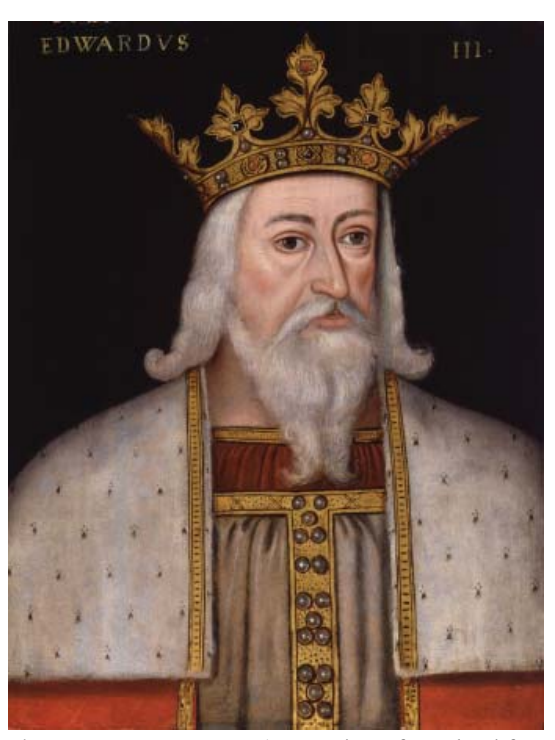
Edward III (13 November 1312 – 21 June 1377) was King of England from 25 January 1327 until his death; he is noted for his military success and for restoring royal authority after the disastrous reign of his father, Edward II. Edward III transformed the Kingdom of England into one of the most formidable military powers in Europe. His long reign of fifty years also saw vital developments in legislation and government—in particular the evolution of the English parliament—as well as the ravages of the Black Death.