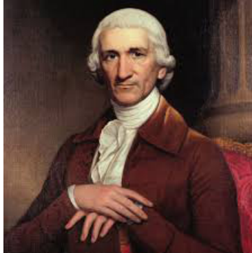
Charles Thomson (1729-1824) was an Irish-born Patriot leader in Philadelphia during the American Revolution and the secretary of the Continental Congress (1774-1789) throughout its existence.