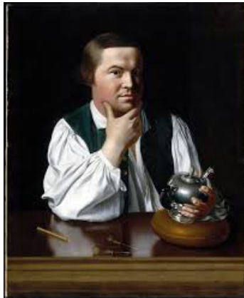
Paul Revere (1734-1818) was an American silversmith, engraver, early industrialist, and a Patriot in the American Revolution. He is best known for his midnight ride to alert the colonial militia in April 1775 to the approach of British forces before the battles of Lexington and Concord, as dramatized in Henry Wadsworth Longfellow's poem, "Paul Revere's Ride" (1861).