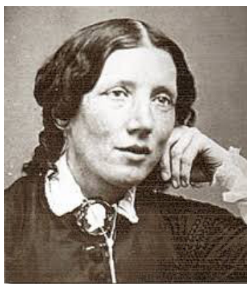
Harriet Elisabeth Beecher Stowe (1811-1896) was an American abolitionist and author. She came from the Beecher family, a famous religious family, and is best known for her novel Uncle Tom's Cabin (1852), which depicts the harsh conditions for enslaved African Americans. The book reached millions as a novel and play, and became influential in the United States and Great Britain, energizing anti-slavery forces in the American North, while provoking widespread anger in the South. Stowe wrote 30 books, including novels, three travel memoirs, and collections of articles and letters. She was influential for both her writings and her public stances on social issues of the day.