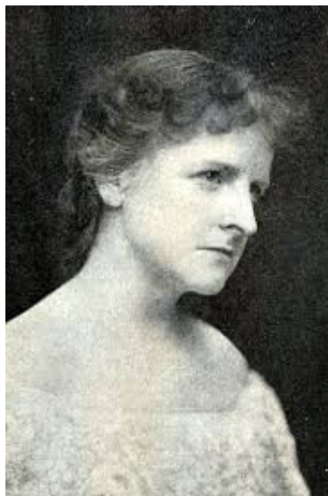
Mary Eleanor Wilkins Freeman (1852-1930) was a prominent 19th-century American author.